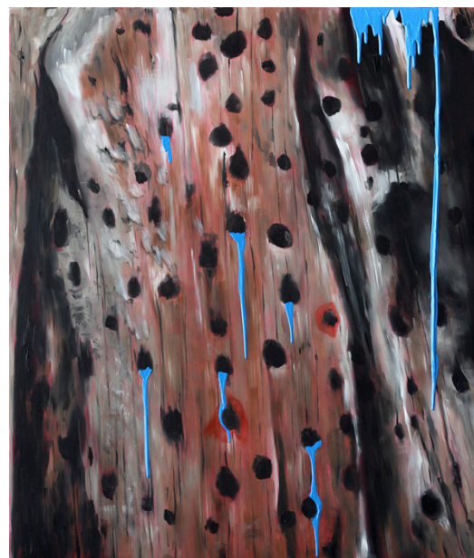
The Weeping Tree 2013 oil on canvas over panel 24 x 20 inches

The Land of Forgotten Dreams , is another painting marking time. The wood was found in the Angeles National Forest which attracted her because a tree's rings are nature's way of recording time. In her characteristic way, Adams manipulates paint in several different styles of painting—in the host abstract background, semi-representational tree trunk and meticulous double-K letter; taken from the Cyrillic alphabet. This double-K, is the first letter in the Russian word for "woman" and appears as a signifier on ladies restrooms. Whereas the letters are taped off then textured, the splash of black is applied with a rag—and the upturned configuration of "&" is a hanger, left for the viewer to interpret.