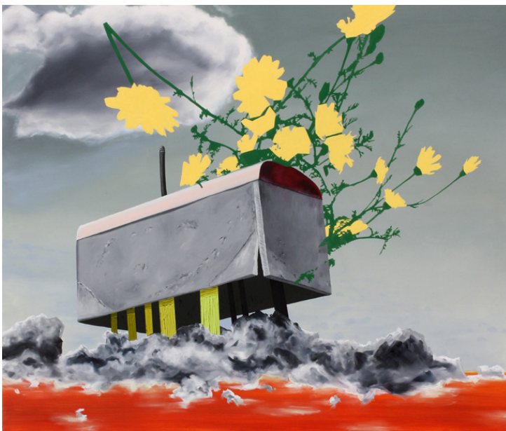
Portentous Rhapsody 2013 oil on panel 40 x 48 inches

Imaginative reflection is a state of mind associated with solitude —which is intimately connected to melancholy. Adams is uncompromising in her pursuit of the solitude necessary for making authentic paintings. By turning away from distractions she carves out a personal space where her own imagination can flow without interruption. It is this commitment to the solitary life of an artist that informs her paintings and imbues them with an unmistakable emotional force. This compelling quality pulls in the viewer's attention, almost like cinematography—making her melancholic paintings a space in which the viewer can to escape into their own dream-like state of reflection. Interestingly, European film makers like Werner Herzog and Andrei Tarkovsky are the strongest influence on Adams' approach to painting and led to her rejection of the usual imposed didactic. Just as these filmmakers refused to impose a dominant narrative and used the visual poetry of cinematic images to allow the viewer freedom to discover their own meanings, Adams' paintings have an indefinability which allows the viewer to use their own imagination.