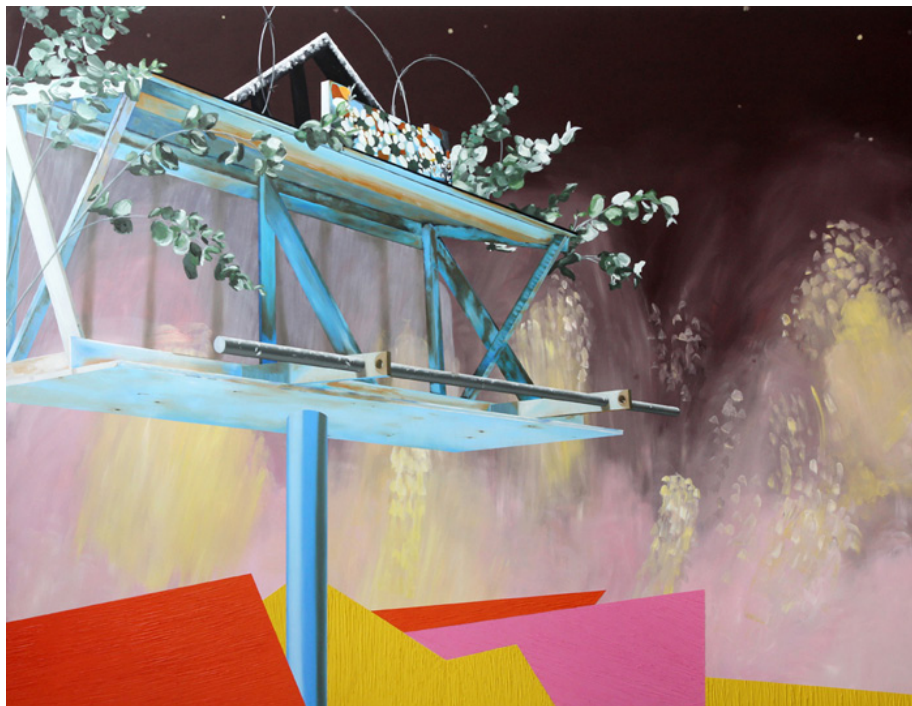
Drowning Out All Birdsong 2013 oil on canvas over panel 65 x 84.5 inches

A series of six new paintings on view at: Miami Project—CBI Gallery booth #215 December 3-8, 2013