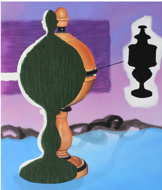
The Magic Hand 2013 oil on canvas over panel 24 x 20 inches

In two paintings— The Magic Hand and Fast, Cheap and Out of Control (EM) —Adams uses silhouettes for the first time, as stand-ins for objects, creating three generations of representation: the textured abstraction, the semi-representational image and the black silhouette. In this way she deliberately baffles the viewer with different ways of entering the paintings. Adams is