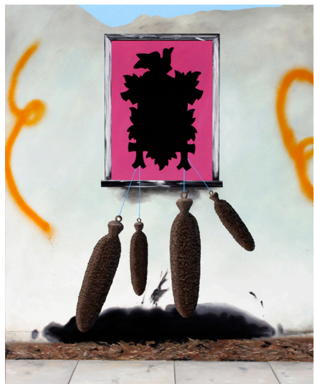
Fast, Cheap and Out of Control (EM) 2013 oil and spray paint on canvas over panel 48 x 40 inches